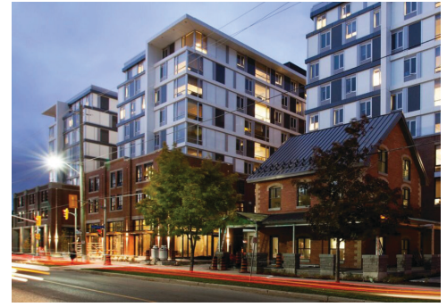
THE ANNEX Ottawa, ON · PBSA