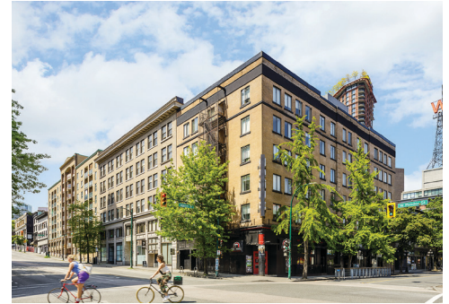
ALMA GASTOWN VANCOUVER Vancouver, BC · Furnished Rentals