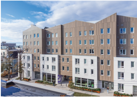
ALMA @ SOUTH END Halifax, NS · PBSA