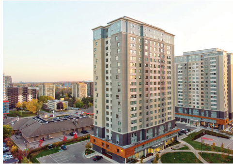
FERGUS HOUSE Waterloo, ON · PBSA