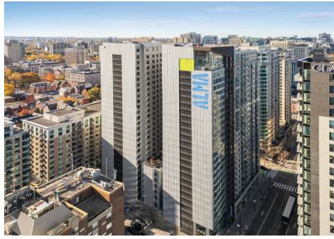
ALMA @ BYWARD MARKET Ottawa, ON · PBSA