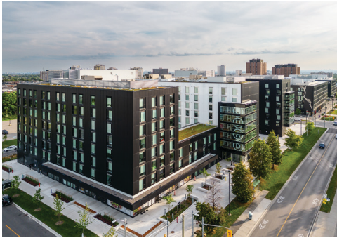
QUAD C4 Toronto, ON · PBSA